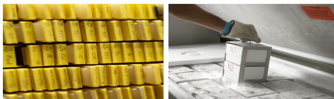
Figure 1: NBB’s collection of formalin-fixed paraffin embedded tissue blocks (left) and one of the NBB’s -80 °C freezers where the frozen tissue is stored

The specimens collected by the NBB are obtained from donors with a variety of brain diseases. These include Alzheimer’s disease, Parkinson’s disease, Lewy body disease, vascular dementia, frontotemporal dementia, multiple sclerosis (MS), multiple system atrophy, progressive supranuclear palsy, various psychiatric disorders and to a lesser extent Down’s syndrome, amyotrophic lateral sclerosis, and Huntington’s disease. Furthermore, the NBB can supply samples from controls without neurological or psychiatric history.