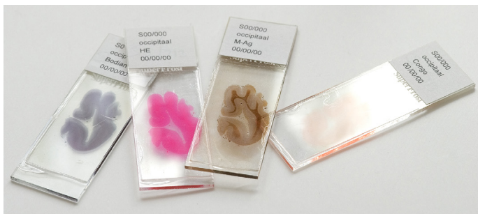
Figure 5: Brain sections for diagnostic purposes.

Every application is reviewed by an independent scientific committee, on availability of the material (diagnosis and anatomical area) and scientific quality. If the application is approved, the NBB will determine the financial contribution for the researcher that is meant to compensate for part of the costs made by the NBB. Up-to-date unit prices can be found on www.brainbank.nl .