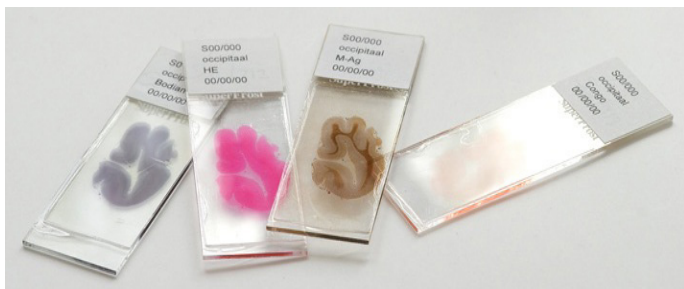
Figure 5: Brain sections for diagnostic purposes.

When supplementary samples are needed to continue a research project that has already been approved by the NBB's scientific committee, the researcher can send us the Supplementary Application Form, also available on the eNBB, explicitly mentioning the project number (see also the flowchart on page 3).