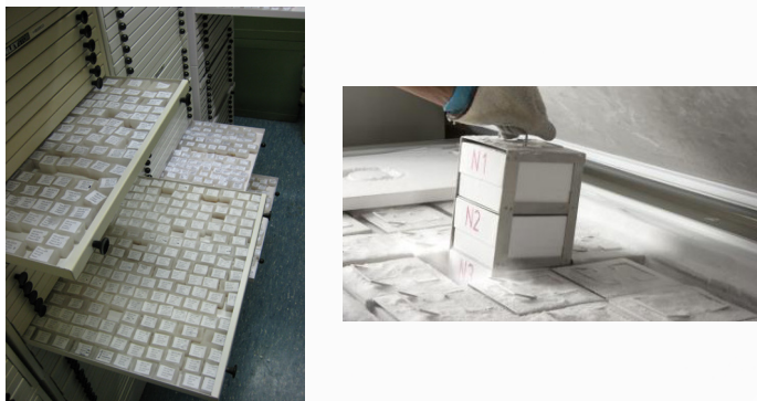
Figure 1: NBB's collection of formalin-fixed paraffin embedded tissue blocks (left) and one of the NBB's -80 °C freezers where the frozen tissue is stored (right).

The specimens collected by the NBB are obtained from donors with a variety of brain diseases. These include Alzheimer's disease, Parkinson's disease, Lewy body disease, vascular dementia, Pick's disease, frontotemporal dementia, multiple sclerosis (MS), multiple system atrophy, progressive supranuclear palsy, and to a lesser extent Down's syndrome, amyotrophic lateral sclerosis, motor neuron disease, Huntington's disease, depression, bipolar disorder and schizophrenia. Furthermore, the NBB can supply samples from controls without neurological or psychiatric history.